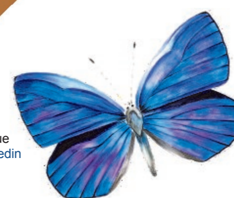
Common blue Glesyn cyffredin